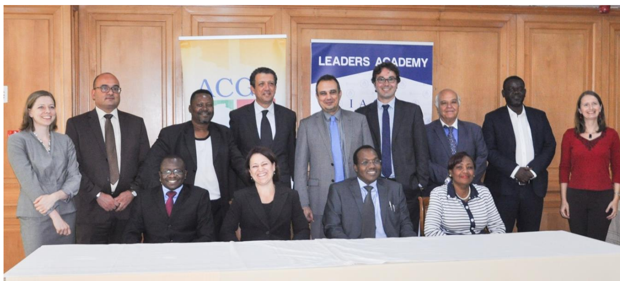
ACGN meeting delegates